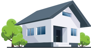
Small or Home based Businesses

We have solutions to suit a wide range of applications