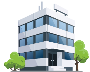
Large Commercial Businesses