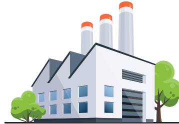
Industry based Businesses